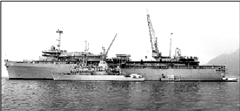
AS 39 Emory S. Land