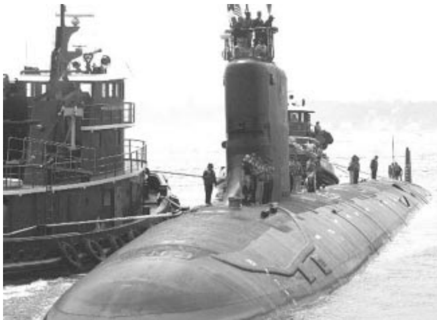
Groton, Conn. (July 30, 2004) - Tugboats assigned to Thames Towing in New London, Conn., ease PCU Virginia (SSN 774) into its berth at General Dynamics Electric Boat Shipyard in Groton, Conn. Virginia returned to Electric Boat following three days of sea trials.